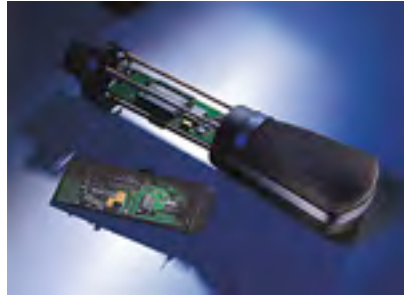
Beyer Digital/Analog Hybrid Mike

Currently, most audio is captured using microphones in an analog form; it is then converted to a digital signal using what is called a A-D Converter (analog to digital). I won't get into all of the stuff about sampling rates and so on, it becomes way too detailed. All microphones have a diaphragm that moves with the sound waves, which converts it to an electronic signal (waveform) and the structure