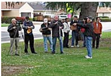
More photos from "Assumptions" shoots. Continued from page 2.

Tilt: While shooting, aiming the camera up or down without changing its base position. ■