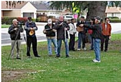
More photos from "Assumptions" shoots. Continued from page 2.

Tilt: While shooting, aiming the camera up or down without changing its base position. ■